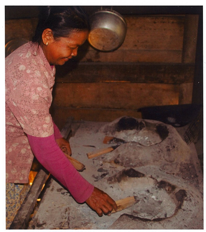
Traditional made cookstove in Kbal Khla Village, Sandan District, Kampong Thom Province, Cambodia

cover which may be caused by human choices of land use. Indirect drivers are results of complex economic, technological, social, political, and cultural variables that can contribute to the change of forest cover (Gautam, 2013). Results showed that the main direct drivers of deforestation and forest degradation included illegal logging and unauthorized encroachment, commercial wood products, and land clearing for commercial agriculture.