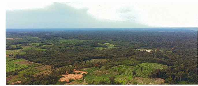
Conversion from forestland to agriculture land in the area near the Prey Kbal O Kranhak Community Forest.

The Royal Government of Cambodia's (RGC) recognises that deforestation and forest degradation negatively affect the livelihoods of poor forest dependent communities, and are significant sources of greenhouse gas emissions both nationally and regionally. As an active Party and a signatory to the United Nations Framework Convention on Climate Change (UNFCCC), Cambodia fully supports the implementation of REDD+, which stands for actions to reduce emissions from deforestation and forest degradation, and foster conservation, sustainable management of forests, and enhancement of forest carbon stocks. Cambodia has been a strong supporter of the