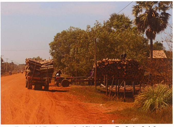
Firewood trade in Krayea Commune, Santuk District, Kampong Thom Province, Cambodia.

Drivers of deforestation and forest degradation can be grouped into direct and indirect drivers. Direct drivers refer to activities that have direct impacts on forest